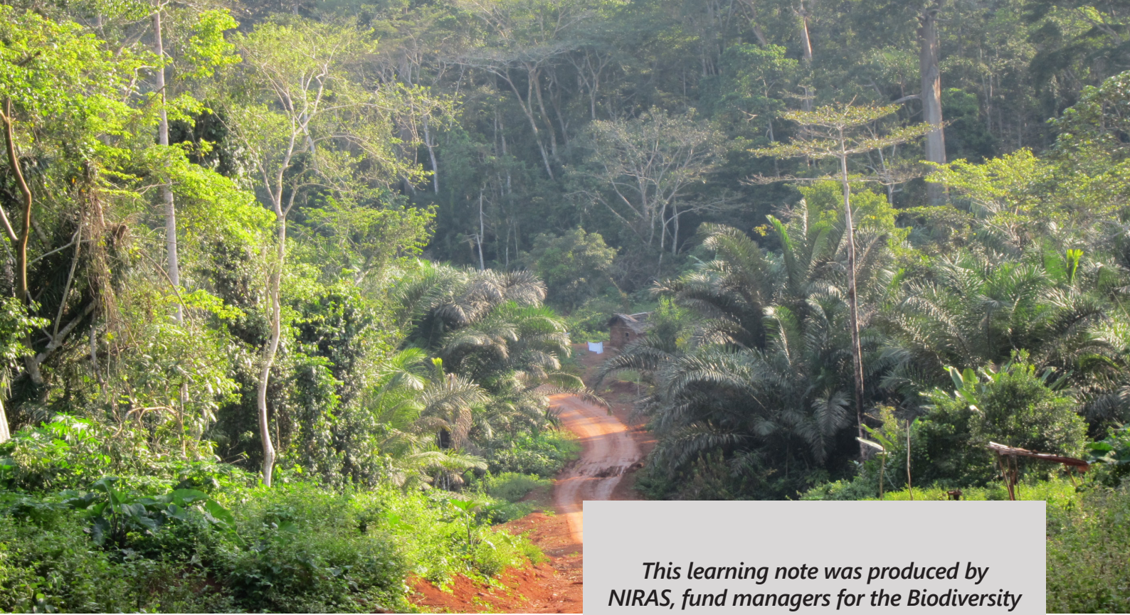
Image Credit: Bristol, Clifton and West of England Zoological Society