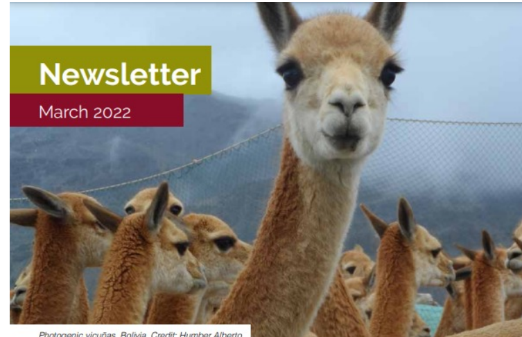
Photogenic vicuñas, Bolivia