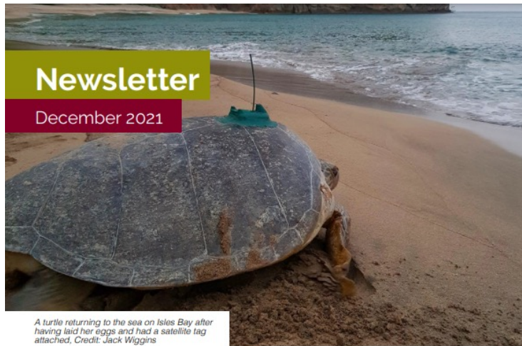
A turtle returning to the sea on Isles Bay after having laid her eggs and had a satellite tag attached.