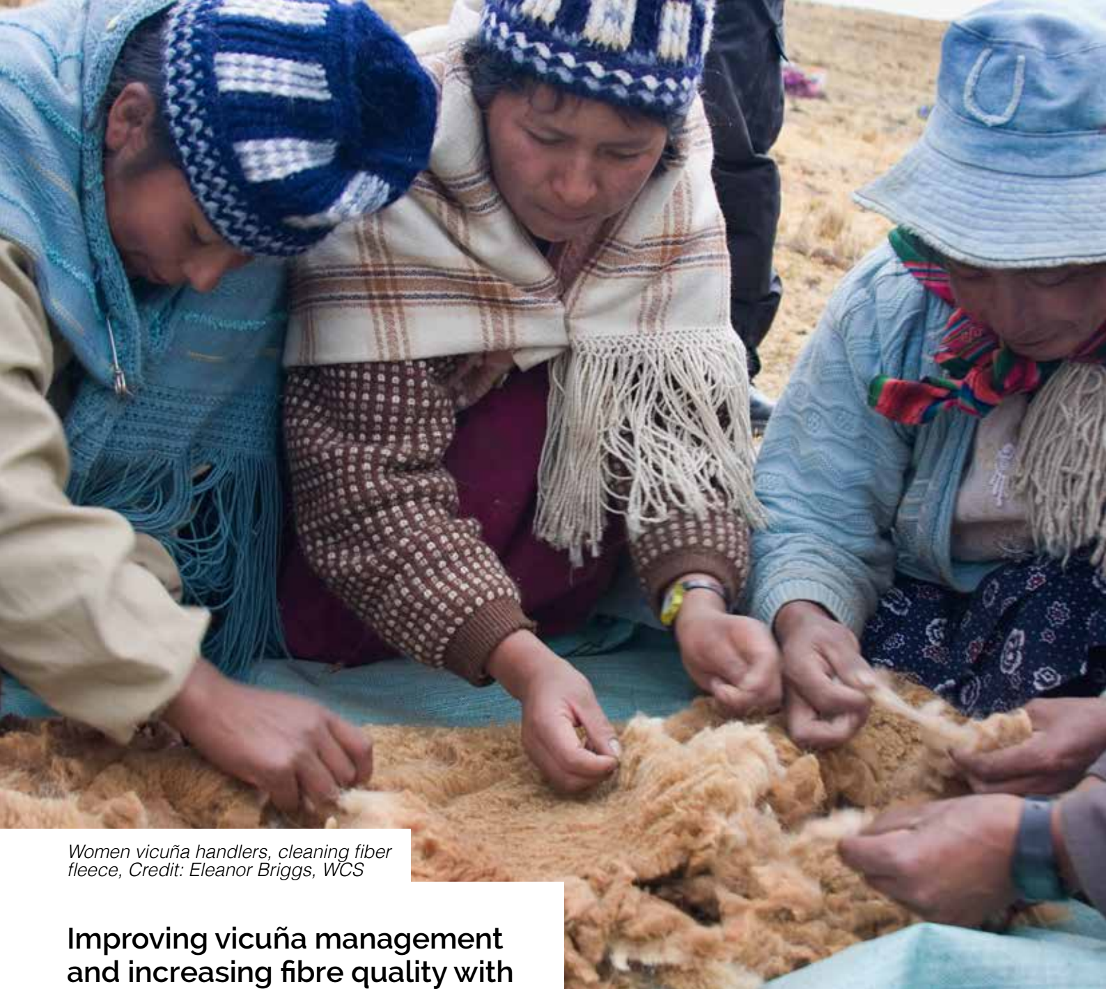
Women vicuña handlers, cleaning fiber fleece, Credit: Eleanor Briggs, WCS