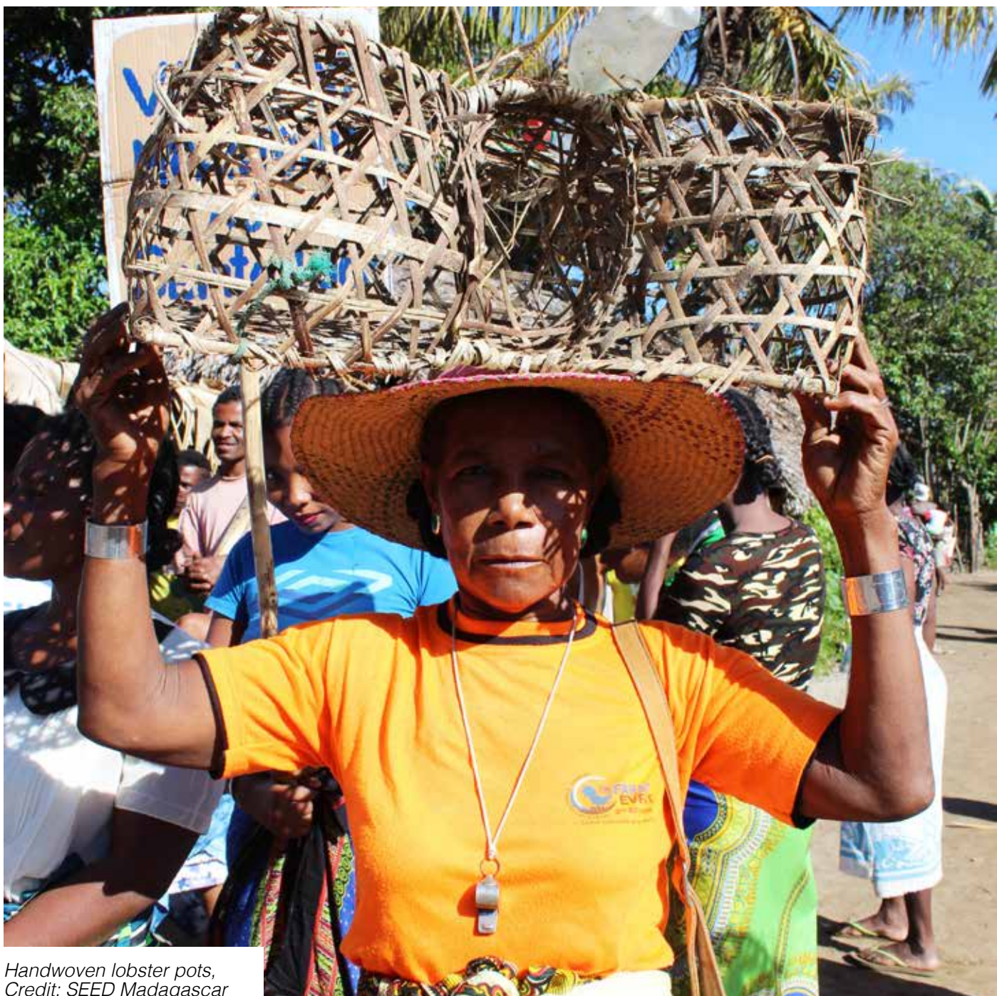
Handwoven lobster pots

Nevertheless, there is a clear demand from local women to engage more actively in decision-making regarding the lobster fisheries management.