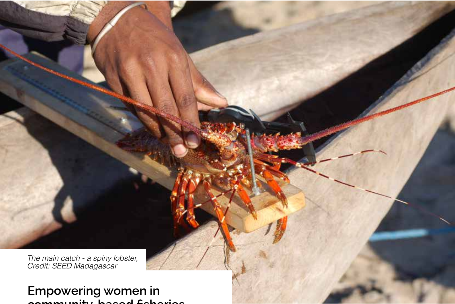
The main catch - a spiny lobster