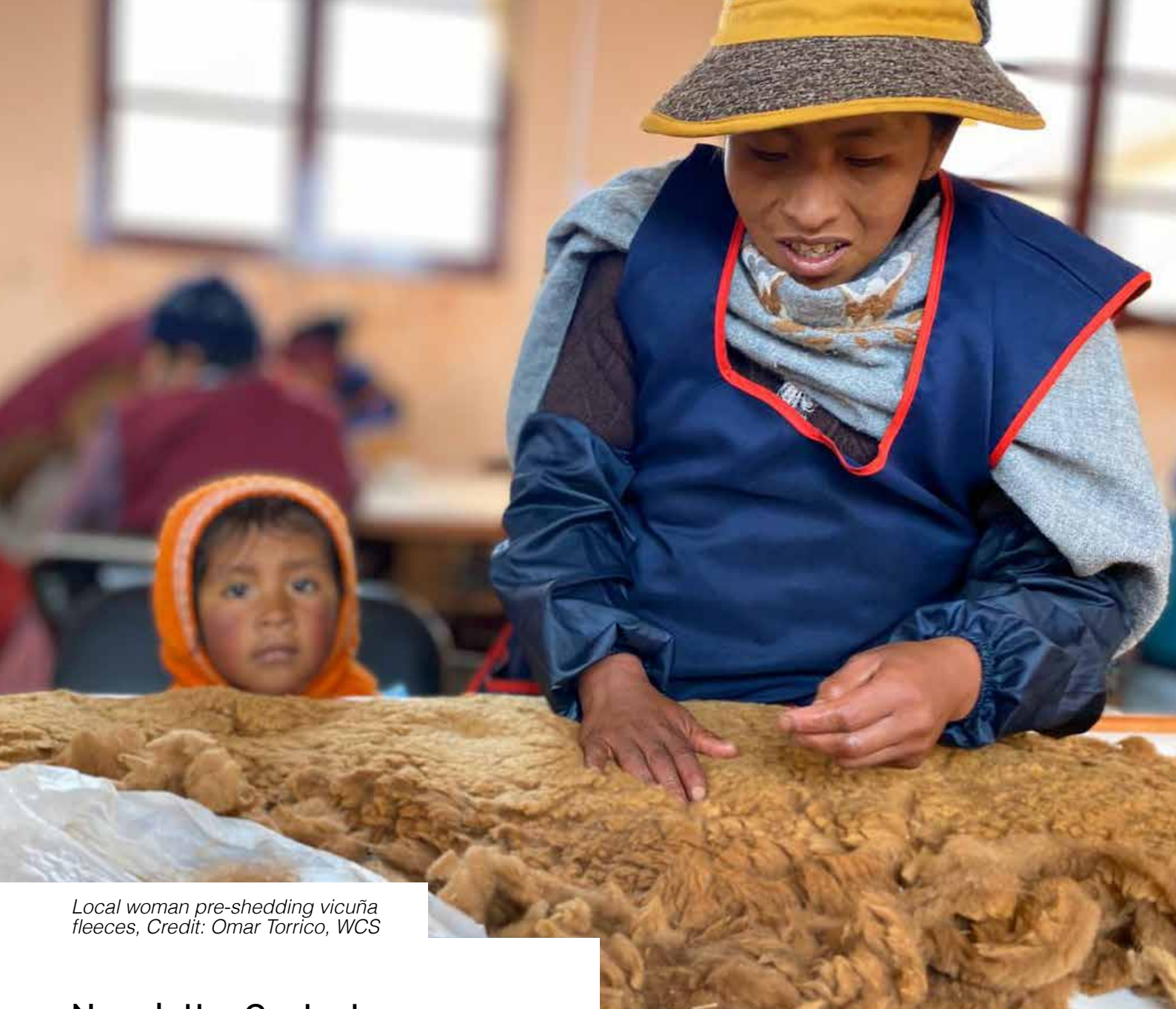
Local woman pre-shedding vicuña fleeces