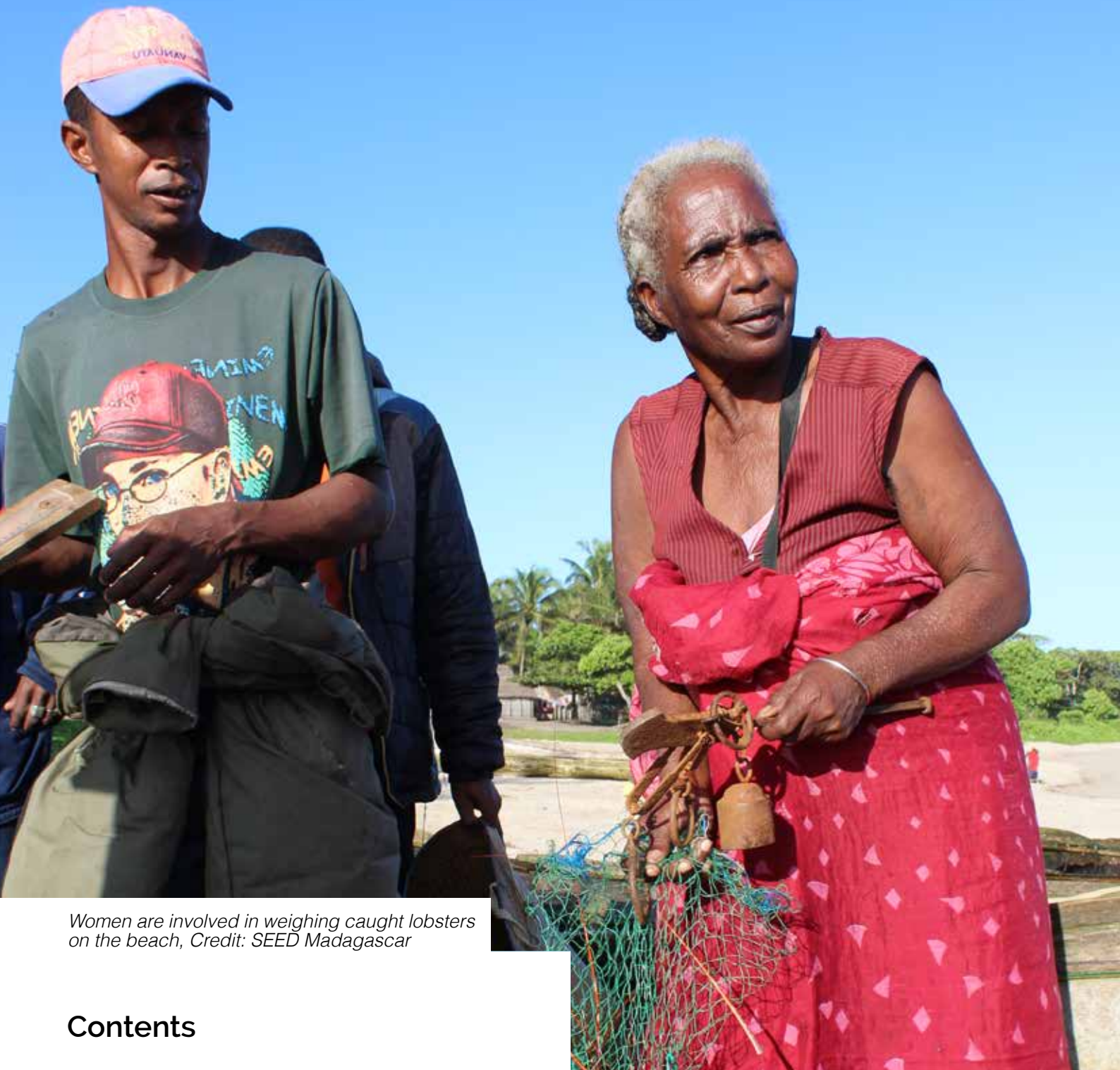
Women are involved in weighing caught lobsters on the beach