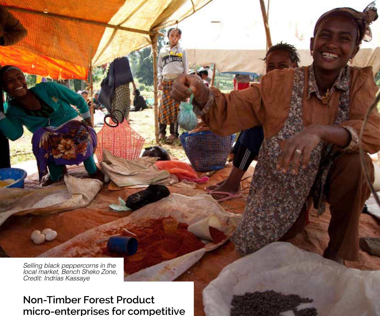
Selling black peppercorns in the local market, Bench Sheko Zone