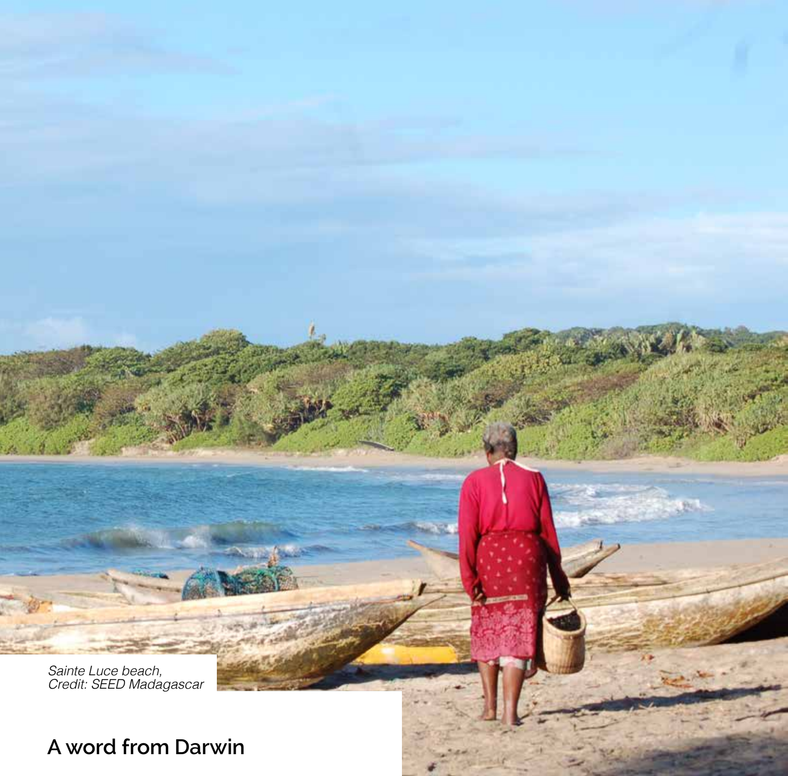
Sainte Luce beach