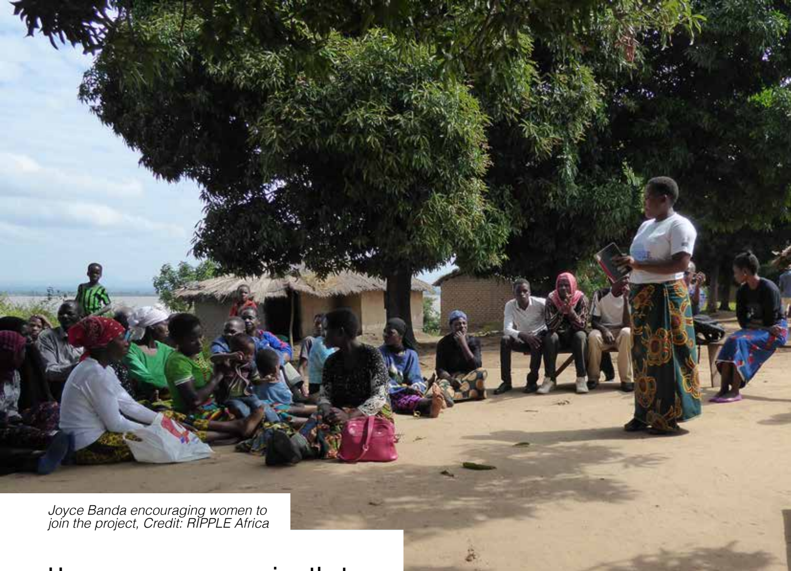
Joyce Banda encouraging women to join the project