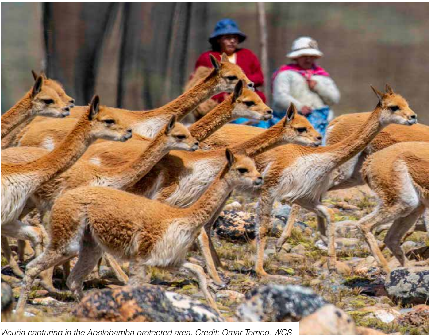
Vicuña capturing in the Apolobamba protected area

For more information on project 26-021, please click here .