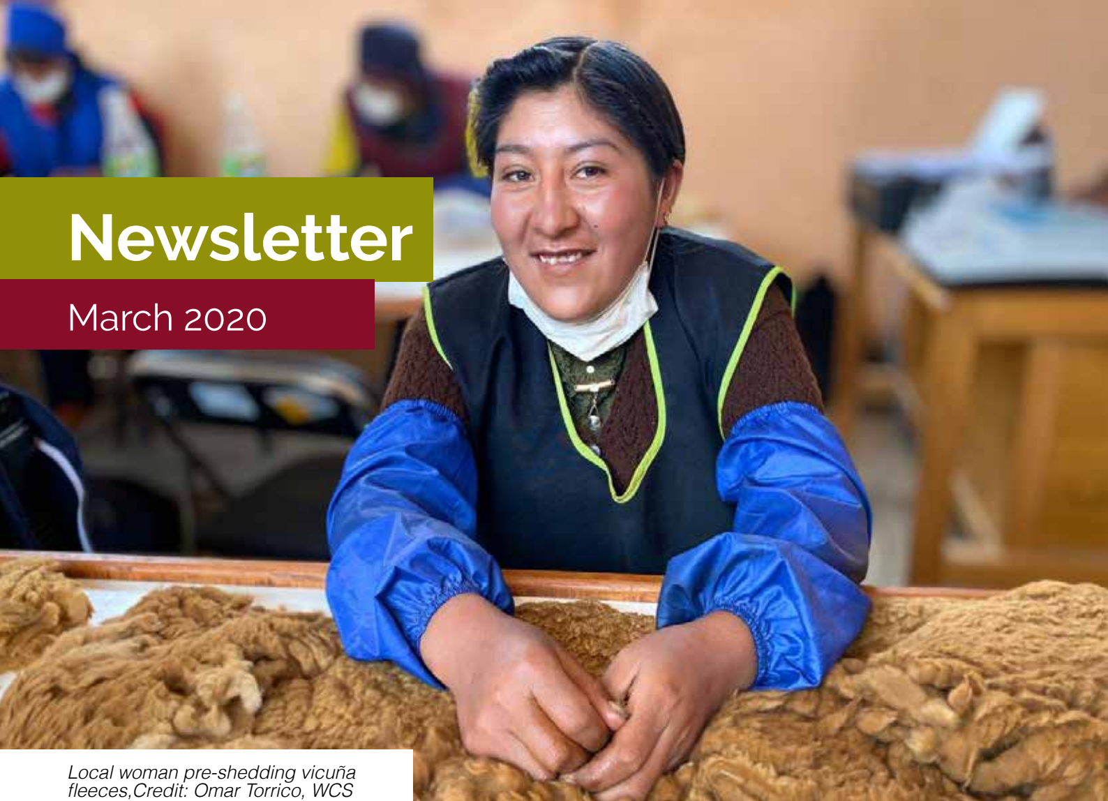
Local woman pre-shedding vicuña fleeces