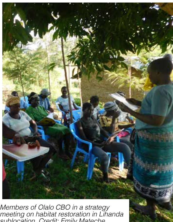
Members of Olalo CBO in a strategy meeting on habitat restoration in Lihanda sublocation

For more information on project 26-003, please click here .