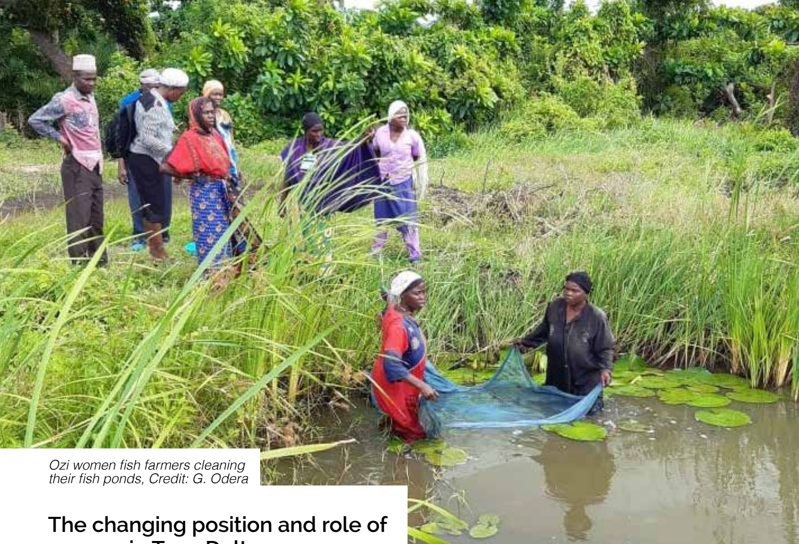
Ozi women fish farmers cleaning their fish ponds