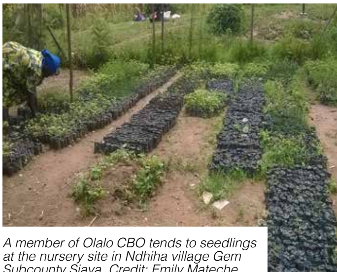
A member of Olalo CBO tends to seedlings at the nursery site in Ndhiha village Gem Subcounty Siaya, Credit: Emily Mateche

The rehabilitation effort is ongoing, with more than 91,000 indigenous tree seedlings due to be planted during the long rains in March.