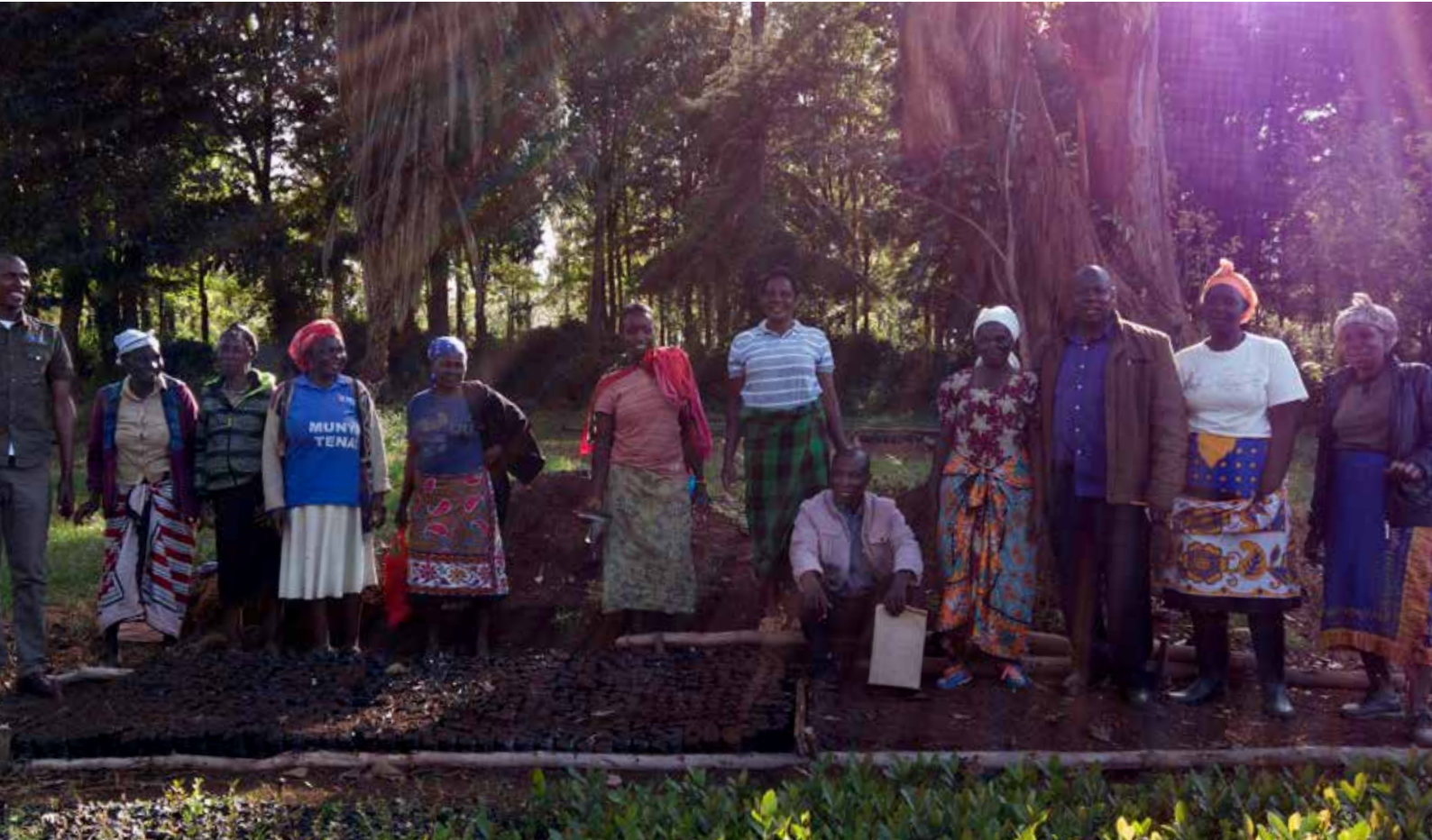
Women in conservation, Credit: Jeremy Là Zelle