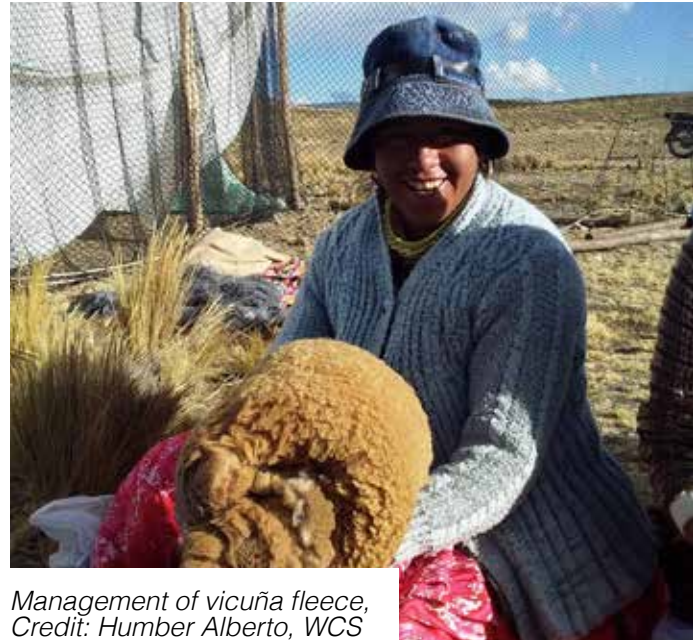
Management of vicuña fleece

In the first quarter, the project has taken the necessary steps to provide added value to the vicuña fibre obtained through training in pre-shedding techniques, which will increase the quality of the fibre.