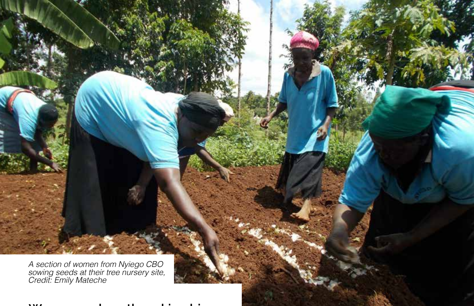
A section of women from Nyiego CBO sowing seeds at their tree nursery site