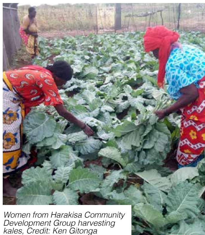
Women from Harakisa Community Development Group harvesting kales

For more information on project 24-013, please click here .