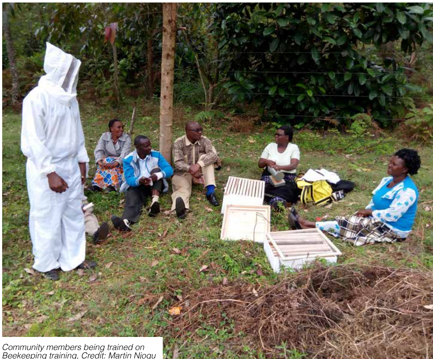
Community members being trained on Beekeeping training

For more information on project 25-031, please click here .