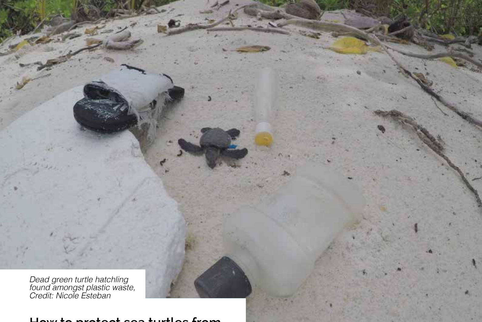
Dead green turtle hatchling found amongst plastic waste, Credit: Nicole Esteban