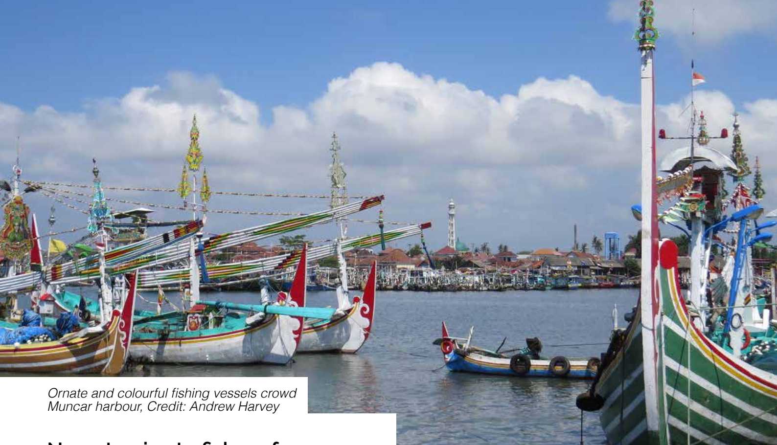
Ornate and colourful fishing vessels crowd Muncar harbour