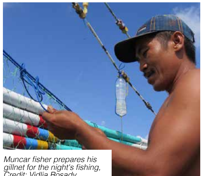
Muncar fisher prepares his gillnet for the night's fishing

With insufficient municipal solid waste management systems, the monsoonal rains wash vast volumes of plastic into streams and rivers and eventually to the ocean. This plastic contributes to Indonesia's position as the world's second biggest ocean polluter, exceeded only by China.