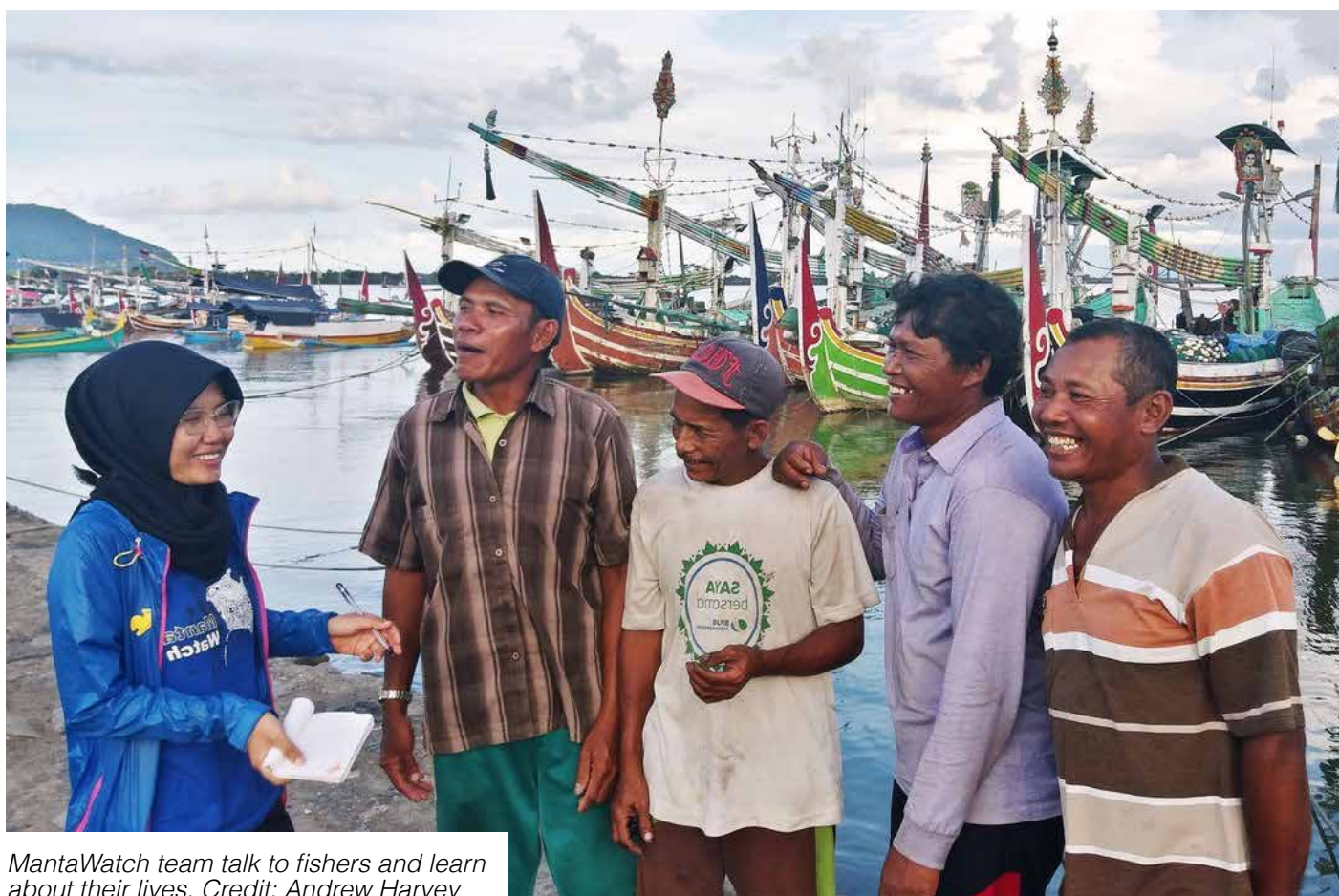
MantaWatch team talk to fishers and learn about their lives

More information on project DARSC177, can be found here .