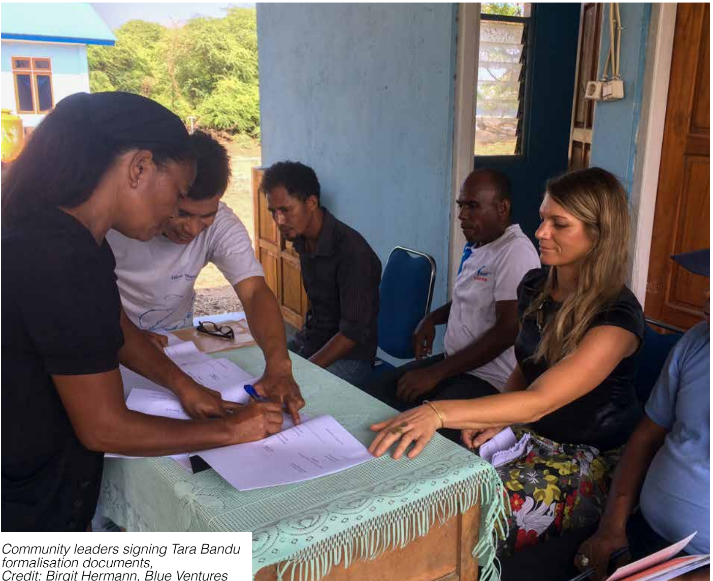
Community leaders signing Tara Bandu formalisation documents

For more information on project 24-012, please click here . More information on the establishment of the LMMA can be found here .