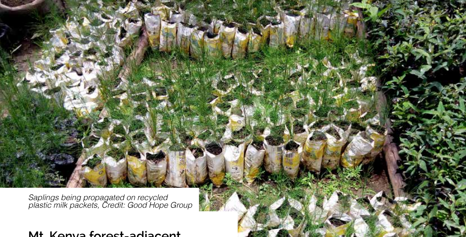
Saplings being propagated on recycled plastic milk packets