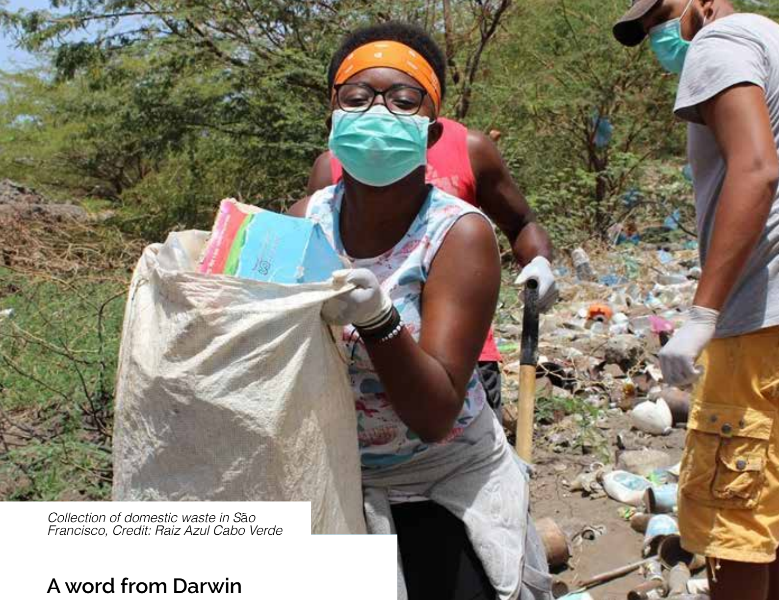
Collection of domestic waste in São Francisco, Credit: Raiz Azul Cabo Verde