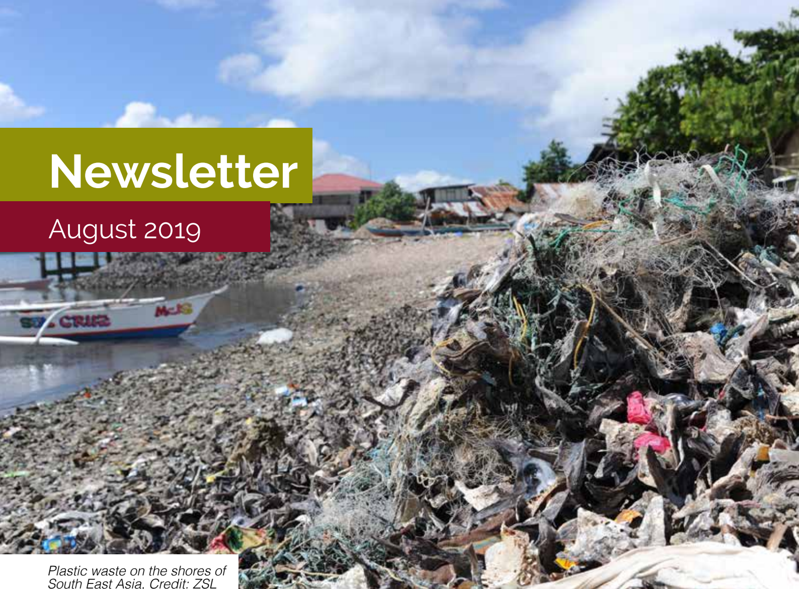
Plastic waste on the shores of South East Asia