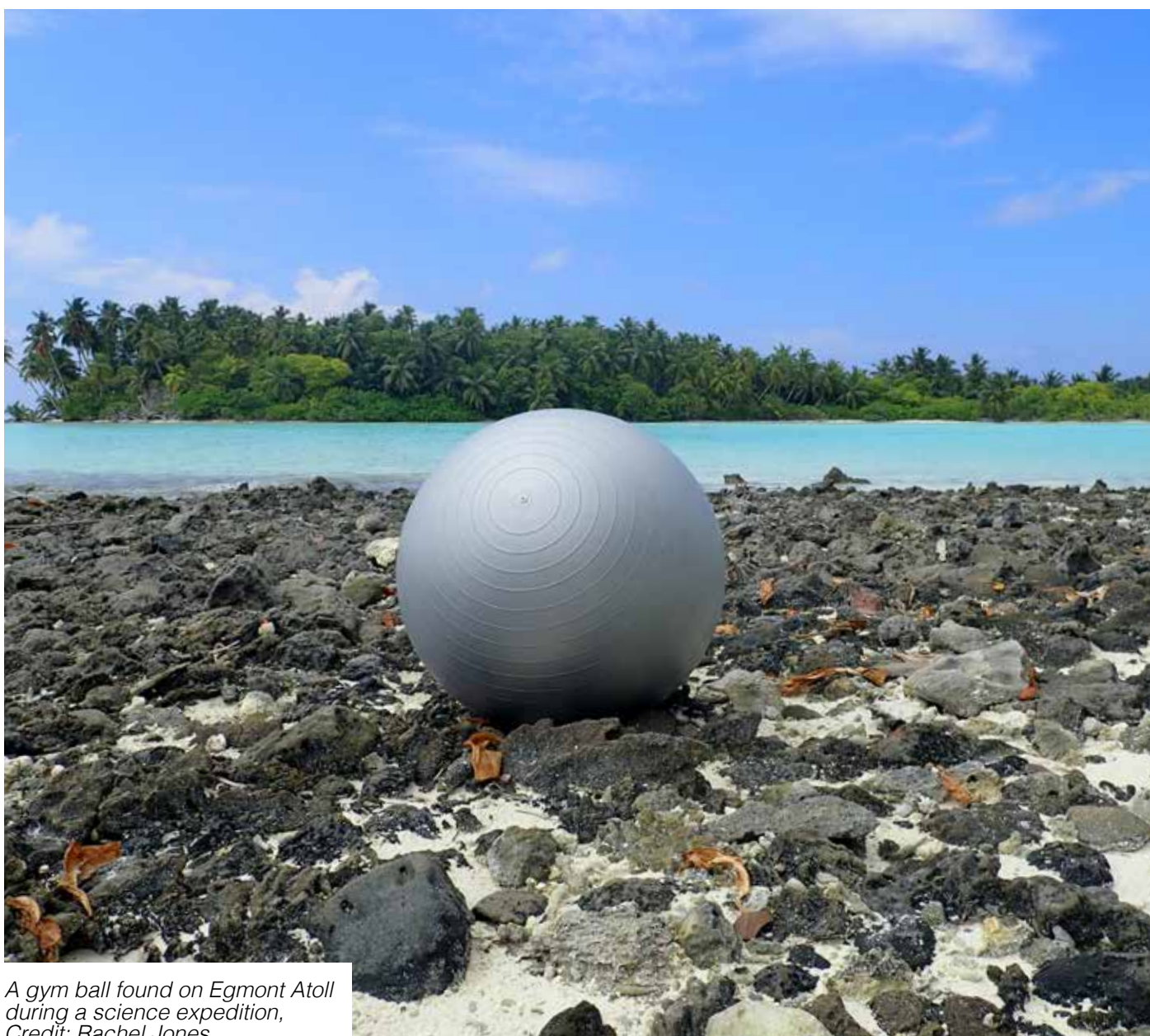
A gym ball found on Egmont Atoll during a science expedition

For more information on project DPLUS090, please click here .