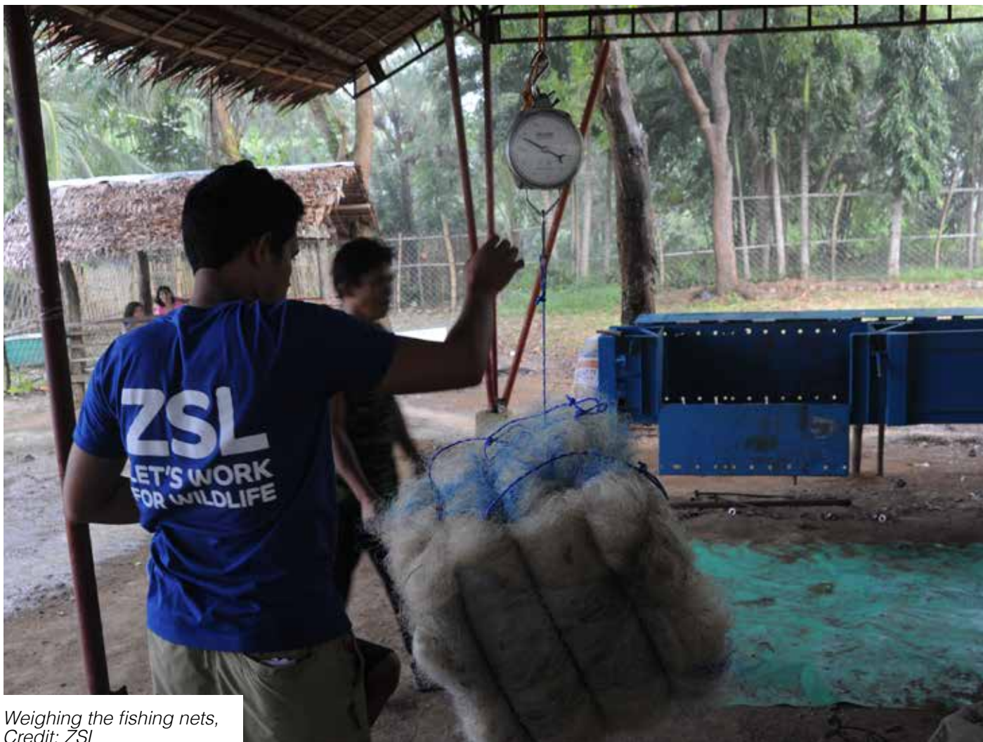
Weighing the fishing nets

Collected nets are recycled by Aquafil, a global producer of Nylon 6 yarn, and supplied to Interface Inc who buy the yarn and turn it into eco-friendly carpet tiles.