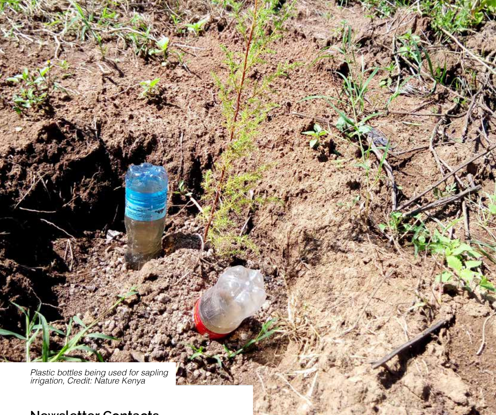
Plastic bottles being used for sapling irrigation, Credit: Nature Kenya