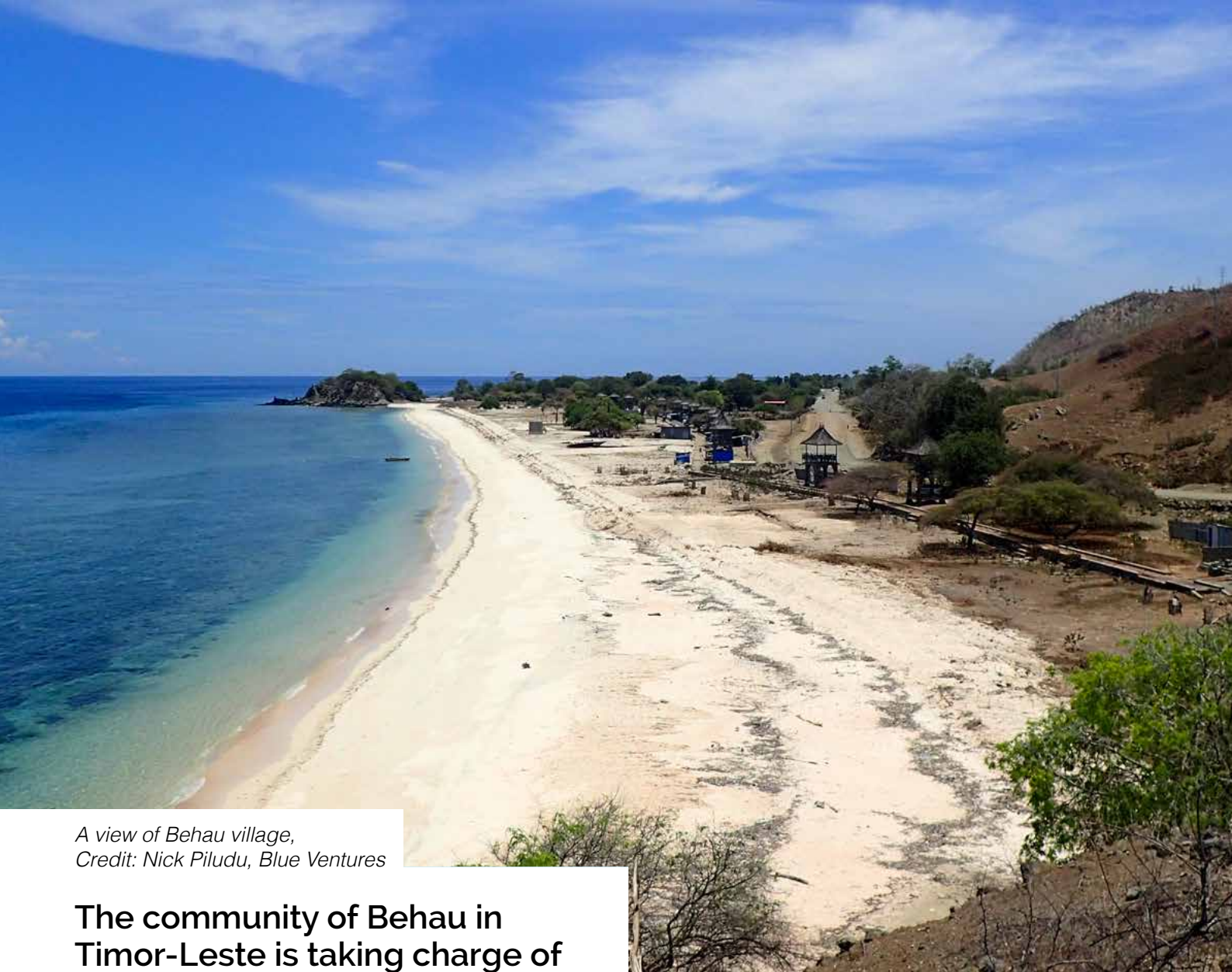
A view of Behau village