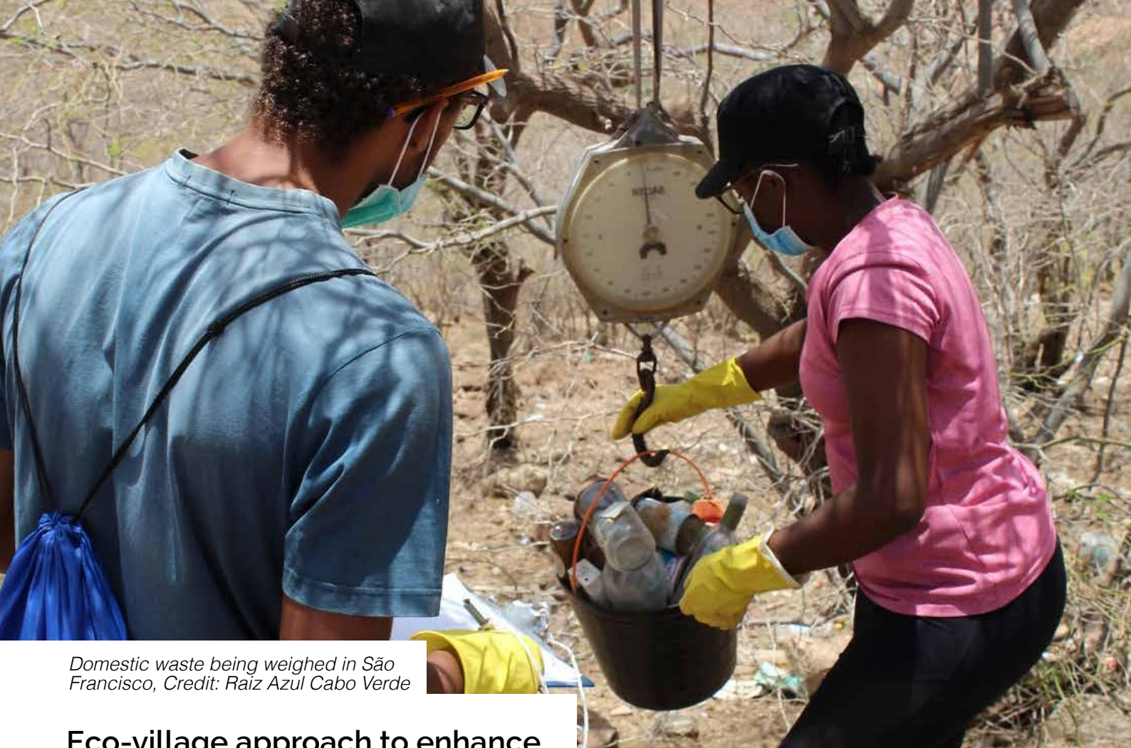
Domestic waste being weighed in São Francisco, Credit: Raiz Azul Cabo Verde