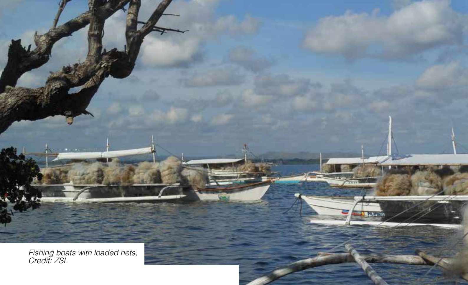
Fishing boats with loaded nets