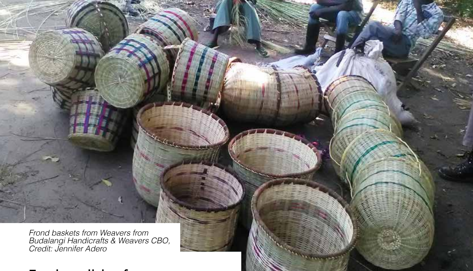
Fronde baskets from Weavers from Budalangi Handicrafts & Weavers CBO