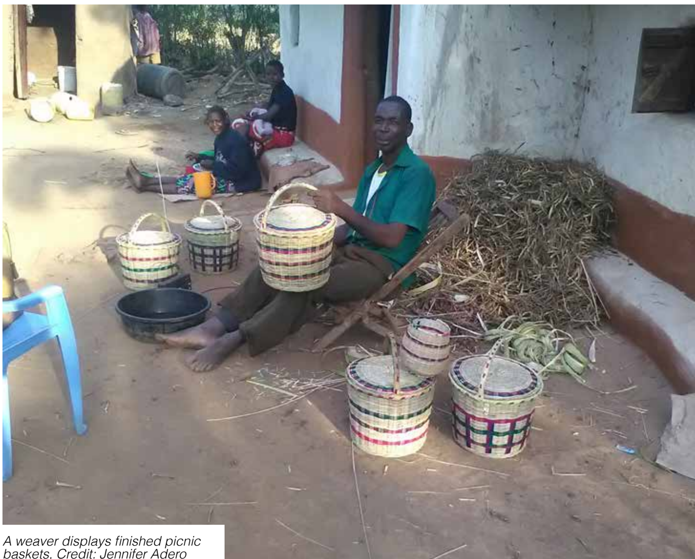
A weaver displays finished picnic baskets