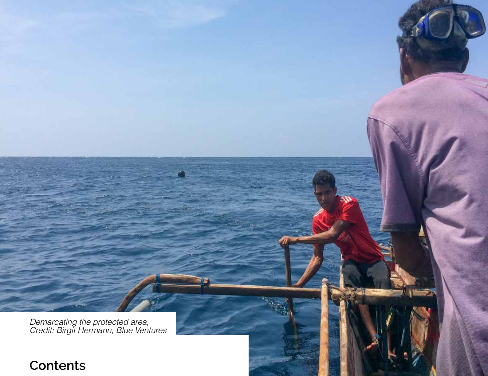
Demarcating the protected area, Credit: Birgit Hermann, Blue Ventures