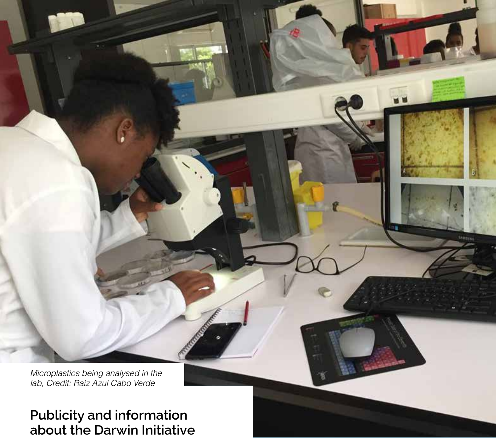
Microplastics being analysed in the lab