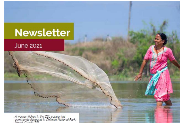
A woman fishes in the ZSL supported community fishpond in Chitwan National Park, Nepal.